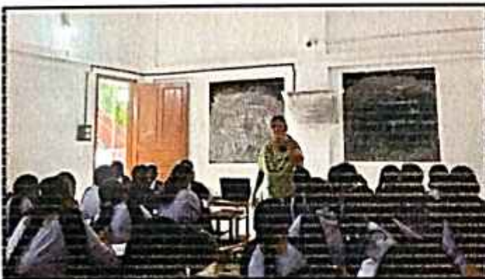
Orientation on varied student needs 12-11-2021