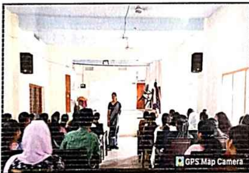
Inclusive education plan on 17.12.2021