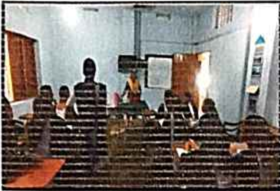
orientation on lesson planning 06.12.2021