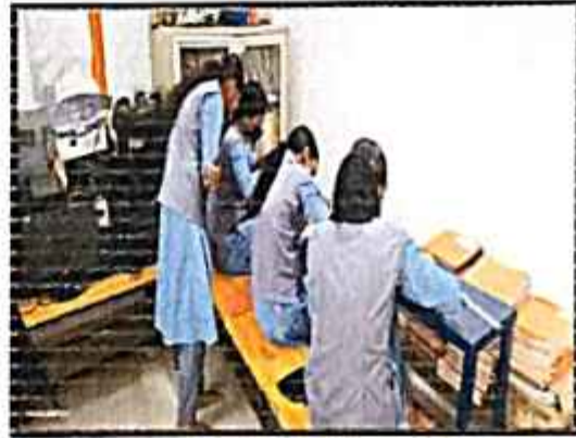
Orientation on Assessment techniques 14.12.2021