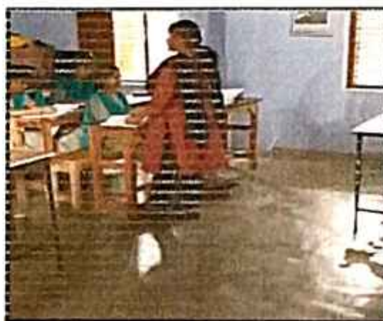
Orientation class on framing instructional objectives 03.12.2021