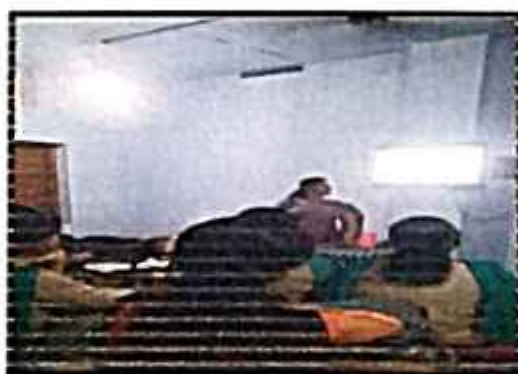
Workshop on mobilizing relevant and varied resources 15-12-2021