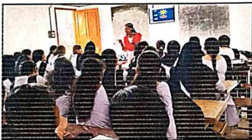
An orientation on student diversity 14-11-2021